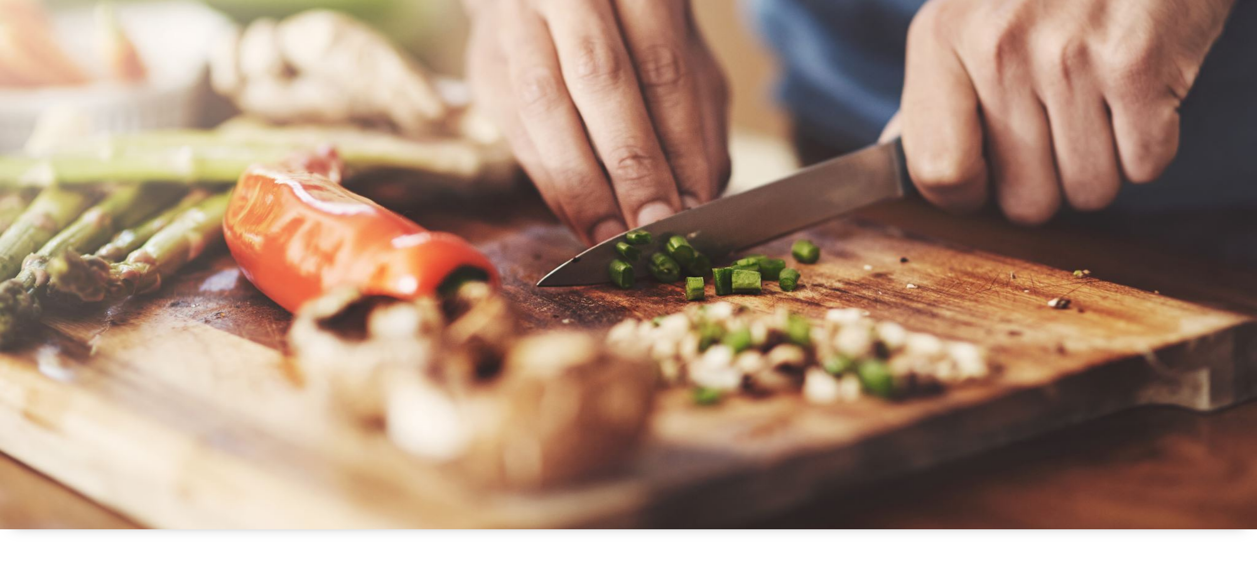
Follow the recipe